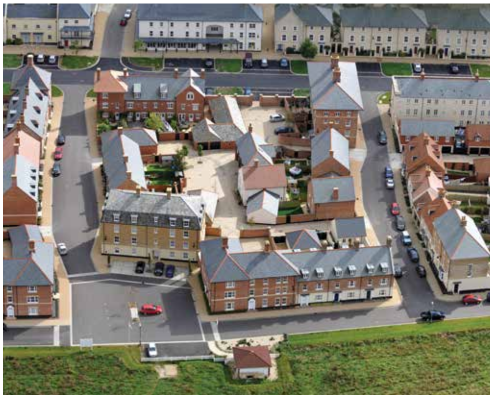
At Poundbury, in Dorset, residents were encouraged to be proactive in their community