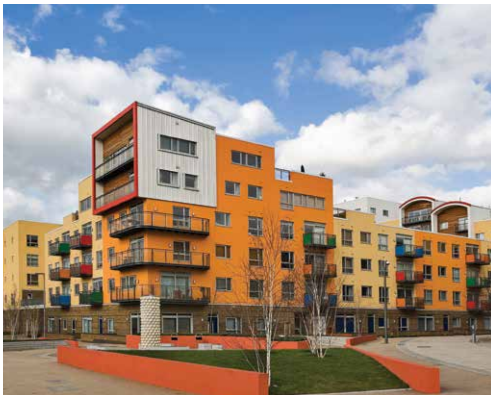
Greenwich Millennium Village is described as 'a good place to raise families'

Researchers were in agreement that the management of mixed-tenure developments has become more complex and challenging. With the move away from bi-tenure, multi-tenure developments have evolved to include a range of new tenures and ownership models including high-value sale units, mid-price sale, shared ownership,