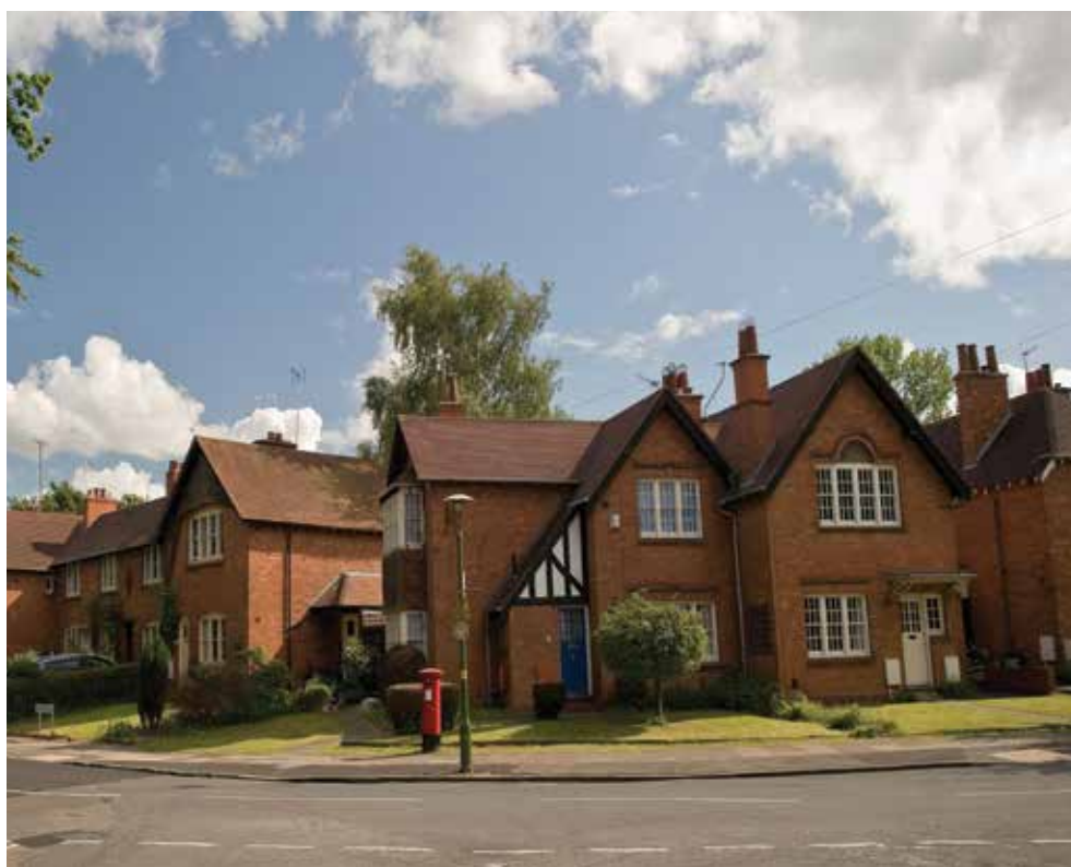
Bournville in Birmingham is an example of a popular and sustainable socially mixed community