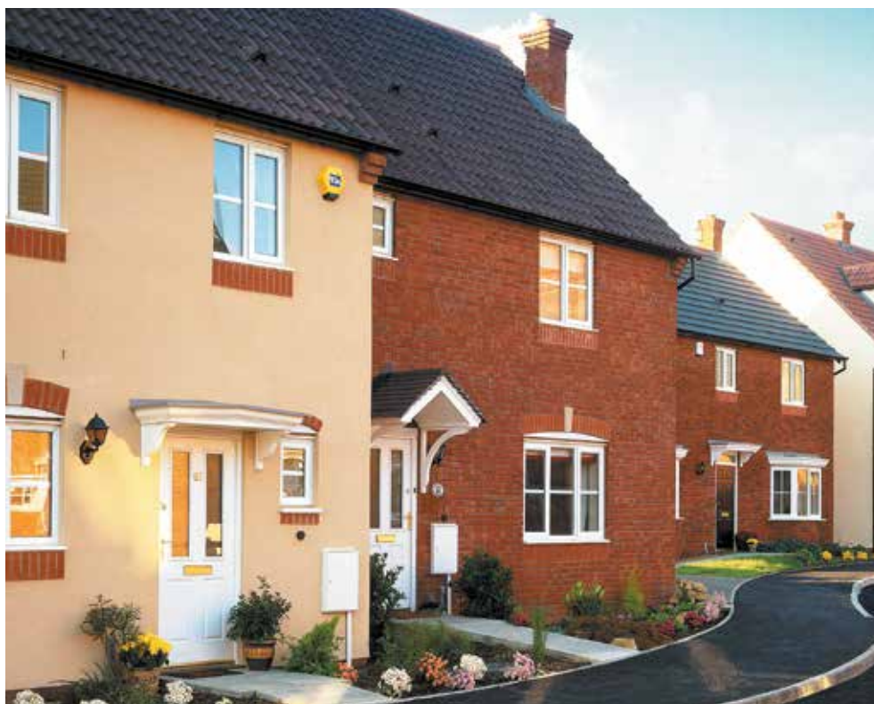
Broad equality in architecture between tenures aids good neighbourly relationships