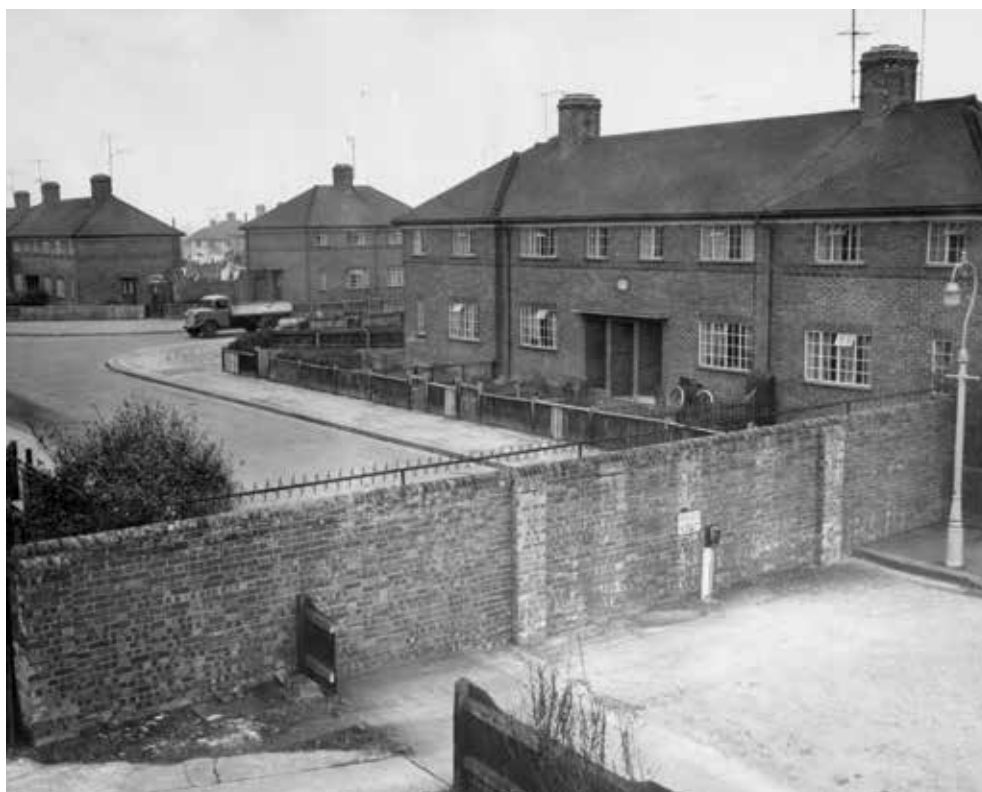
Cutteslowe wall in Oxford (1934), an infamous example of tenure segregation

intermediate rent, market rent, affordable rent and private rent, for example. Robust and preventative management strategies were seen as essential and, where possible, a single management system with clear lines of contact and services to residents should be introduced (Rowlands et al. 2006; Bernstock 2008).