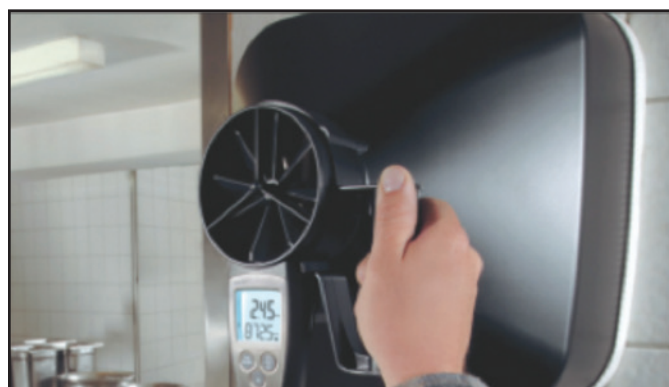
Diagram 2 - Vane anemometer fitted with a hood